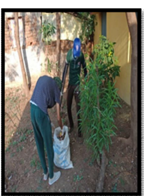
Shramdaan by NSS Volunteers

Meanwhile breakfast was being prepared by another team.