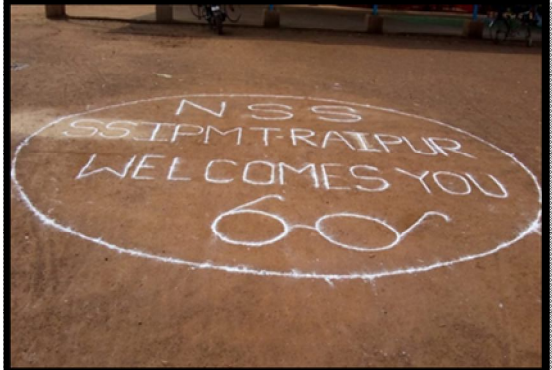
Preparations being done by NSS Volunteers with Full Enthusiasm

On the very first day of camp no cultural events were held in the evening as all the villagers along with NSS Volunteers paid tribute to all our brave soldiers who lost their lives in attack of Pulwama on 14th February.