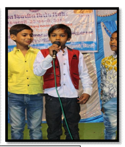
Cultural Events in Evening

Also few of the members of NSS team made a Paint Rangoli of NSS logo which got dry by evening.