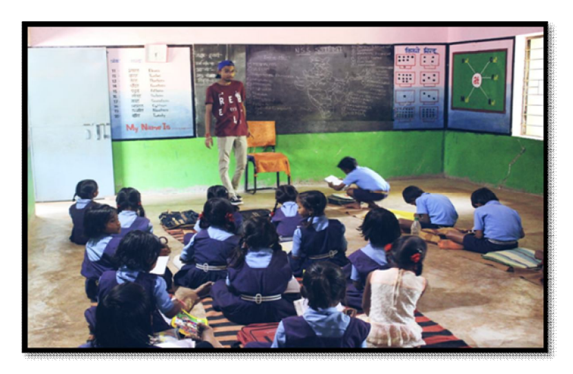
2<sup>nd</sup> std. students learning how to draw Indian Map

The day began with Prabhat Pheri followed by Yoga and Shramdan in which all the NSS volunteers enthusiastically took part. Today the main task of students after Breakfast was to prepare themselves for the nukkad and meanwhile they were grouped into teams who went for Teaching the students in school and also another team held Sports competition among all the students after taking permission from school Principal.